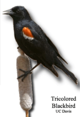
Tricolored Blackbird UC Davis