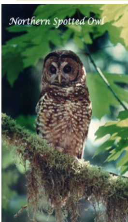
Northern Spotted Owl