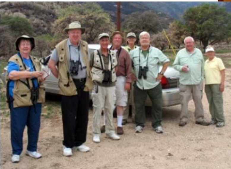
In our working gear