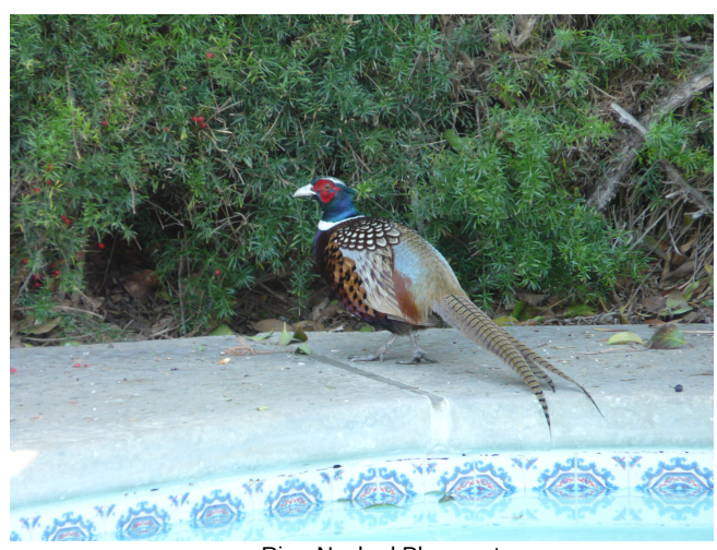
Ring-Necked Pheasant February 11, 2013 - Bakersfield, CA