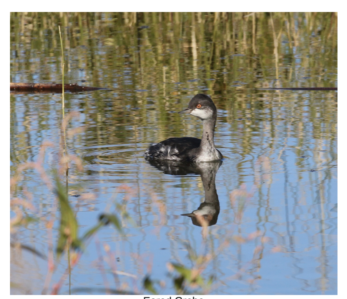
Eared Grebe October 22, 2019