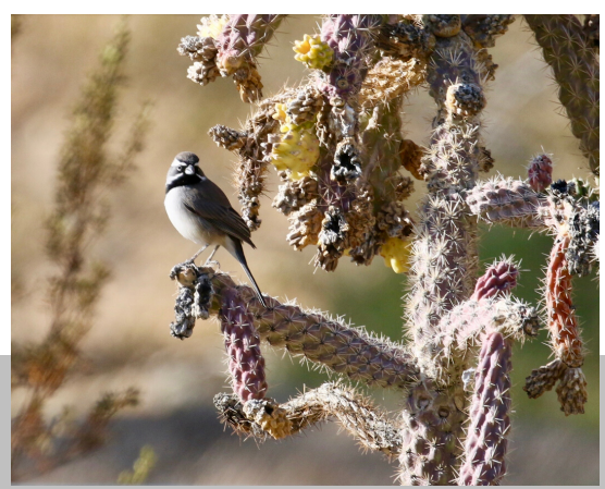
Black Throated Sparrow