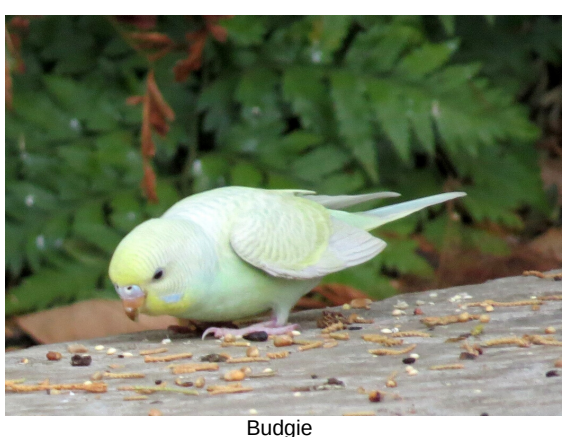
July 29, 2018 - Bakersfield, CA