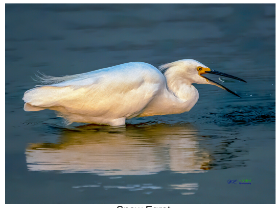
Snow Egret Malibu Lagoon, Los Angeles CA