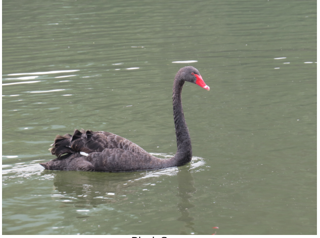
Black Swan February 18, 2015 - Bakersfield, CA