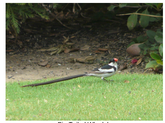
Pin-Tailed Whydah October 2, 2010 - Bakersfield, CA