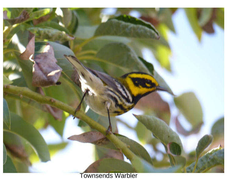
January, 2019 - Bakersfield, CA