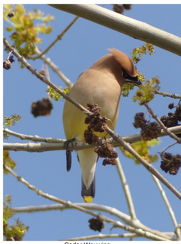
Cedar Waxwing April, 2019 - Bakersfield, CA