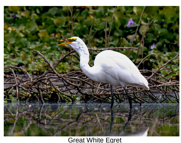
Near the Park at River Walk, Bakersfield, CA