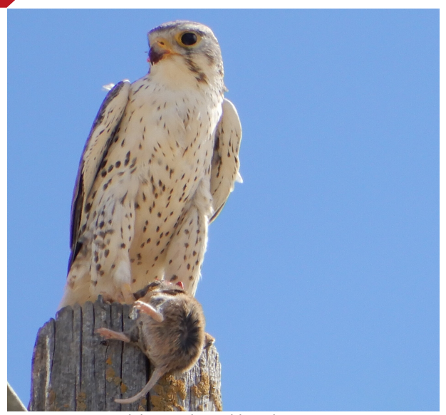
Adult Female Prairie Falcon October 10, 2019 - Carrizo Plain