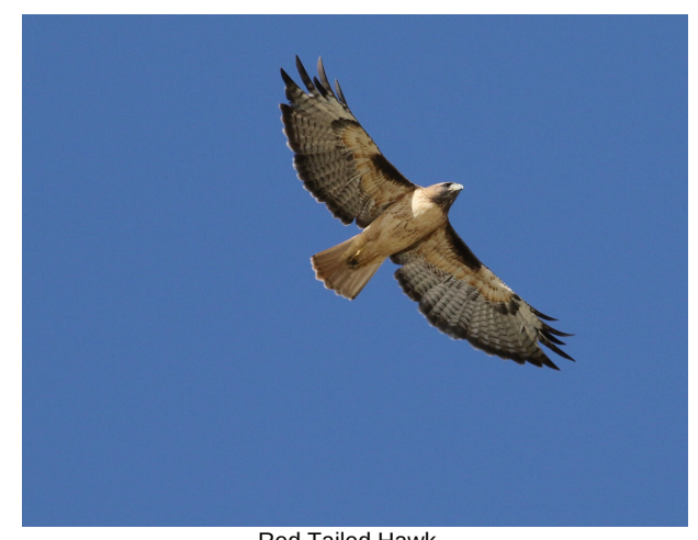
Red Tailed Hawk October 20, 2019 - Galileo Hill, California City