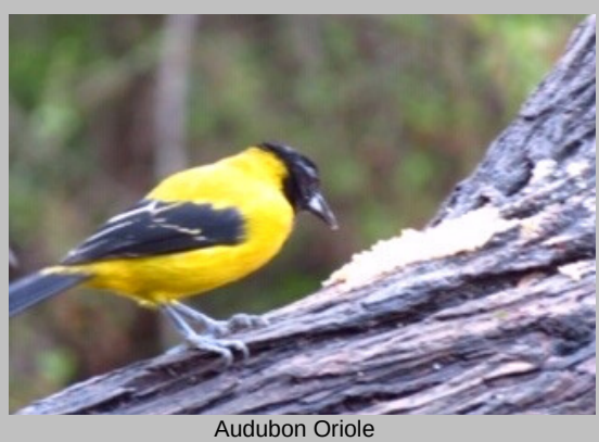
Falcon State Park, 2019