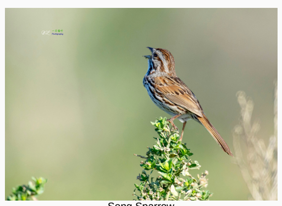
Song Sparrow April 21, 2019 - Basin Wildlife Reserve