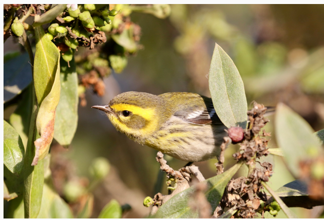
Townsends Warbler North Beach Campground, Pismo Beach October 28, 2019.