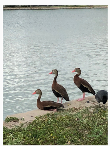
Black Bellied Whistling Ducks Harlingen, Texas