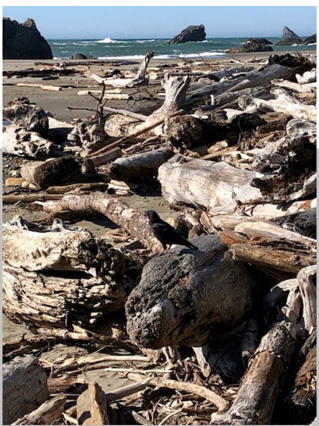
American Crow (Camouflaged in Driftwood) October 29, 2019 - Harris Beach State Park in Brookings Oregon