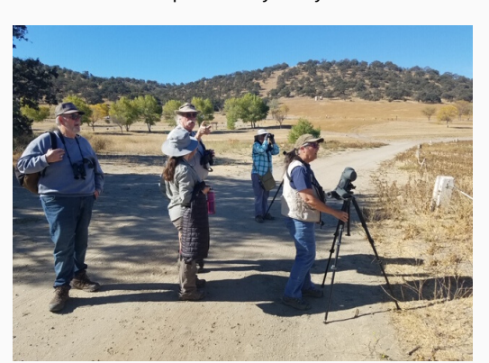
Brite Lake Outing #2 Tehachapi, California