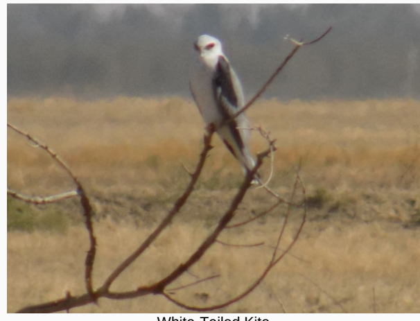
White-Tailed Kite Pixley Preserve November 20, 2019.