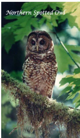
Northern Spotted Owl