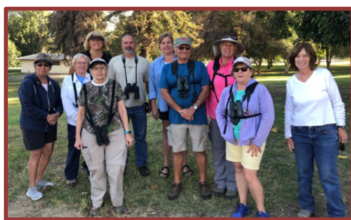
FIELD TRIP FUN: from outing group to Hart Park on September 18th