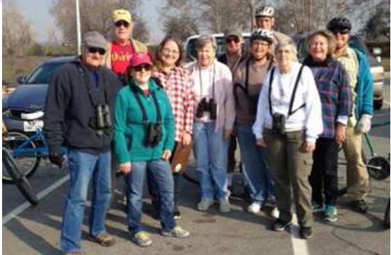
Above: Birds n Bikers February outing

Audubon in the news - To learn about National Audubon go to: www.audubon.org