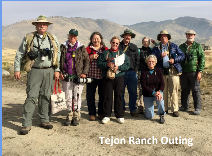
Tejon Ranch Outing