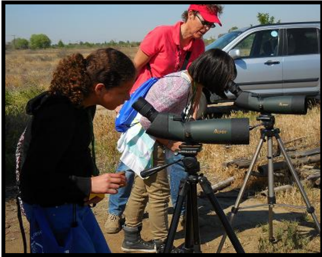
By using spotting scopes students learn that the birds are all around us.

Kern Supt. of Schools 1300 17 th st. Bakersfield (street parking or in lot at 18 th & K)