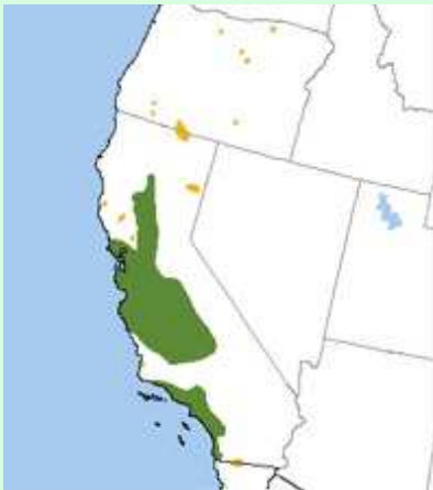
Range map of Tricolored Blackbirds in California