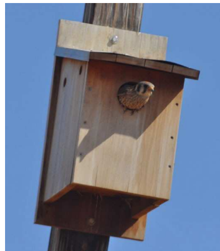
American Kestrel using its nest box at Panorama Vista Preserve 4/20/15.