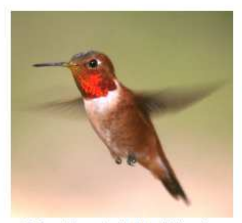
Rufous Hummingbird